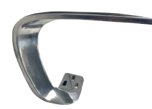
ALUMINUM CC ARM

Height and width adjustable with pivoting arm cap. Arm cap also moves forward and backward in and out.